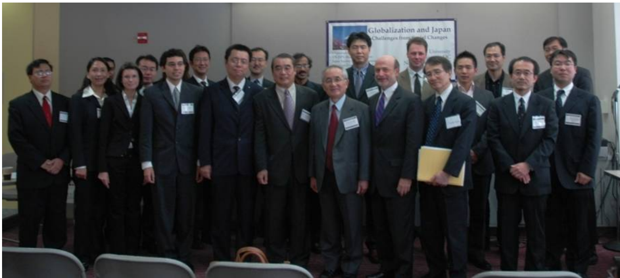
Organizers and guest speakers